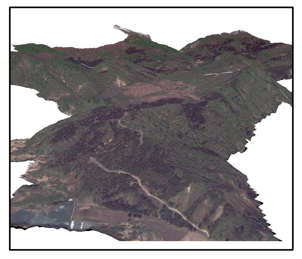
Figure 1. Satellite image of Yamagata basin.

SATPALDA has completed a project for our client based on DEM generation and contour extraction. The study area lies at Yamagata, located in the Tohoku region of northern Japan. 1m DEM was generated. We had a very short time window to deliver a large area as client needed a high-quality data at that time period but our dedicated and experienced team came into action and with full efforts, we finished our project on time with a high-quality output as required by our client. Like any other project, this was also a complete work flow of Aero triangulation, feature extraction and then DEM generation. We also provide a high-quality Orthophoto on the basis of resulted DEM. In Aerial Triangulation mathematical approach is used to process precise and accurate relationships between the individual image coordinate systems and a defined datum and projection (ground).